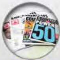
Magazines / Catalogs