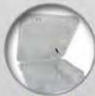
Plastic Food Clam Shells