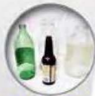
Glass Bottles (all colors)