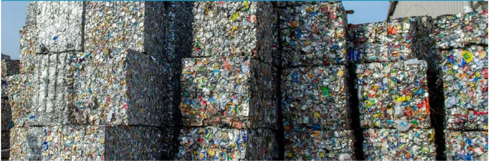
Single Stream recycling baled and ready for shipment Willimantic Waste/Casella Facility