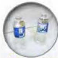
Plastic Bottles (Water, Soda)