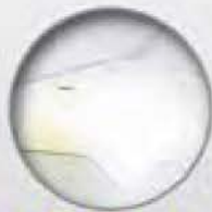
Office Paper & Folders