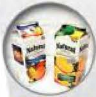
Paper Milk / Juice Cartons