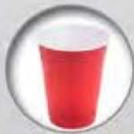
Plastic Cups Lids / Straws go in trash