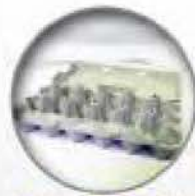
Paper Egg Carton