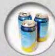
Metal & Aluminum Cans