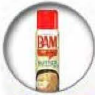
Aerosol Cans (Food Grade)

All Containers Should be Empty And Clean