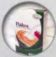
Cereal / Shoe Box